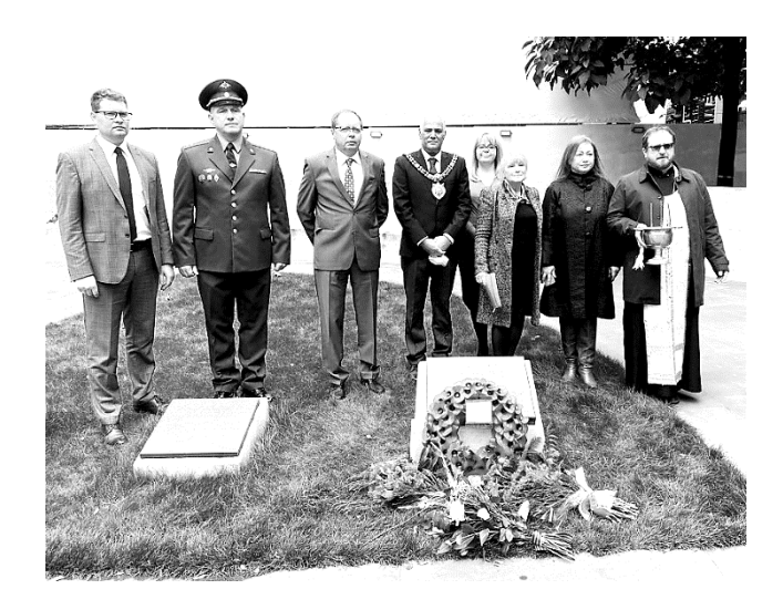
Unveiling ceremony of the Manchester Memorial, (photo courtesy of the Russian Embassy)

The SWMT welcomes news of the unveiling of a plaque in Manchester in early September 2020 dedicated to the 'Soviet soldiers who gave their lives liberating Europe'. It also pays tribute to the citizens of besieged Leningrad (now St Petersburg), Manchester's twin city. The unveiling was attended by the Lord Mayor and the Russian Ambassador. Photographs and more details can be found on the websites of the Russian Embassy (search for "Manchester memorial") and Sputnik News (search for "Manchester plaque").